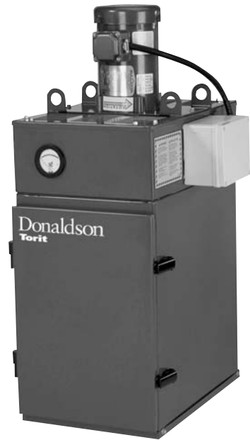
MM 1200 with Optional Junction Box