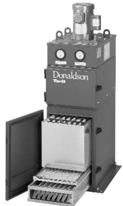
MM 500 with Optional HEPA